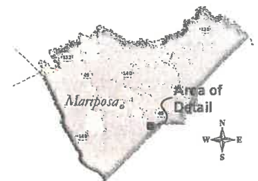
Location in Mariposa County