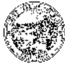
Edmund G. Brown Jr. Governor