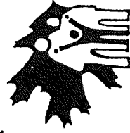
Fig. 5 - Cathey's Valley Park

Mariposa County Parks and Recreation Master Plan