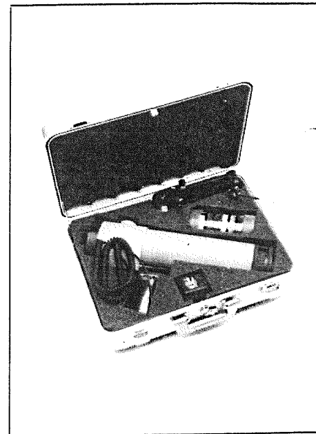
Stylish carrying case with eight reference standards, instrument, battery, cable and recharger.