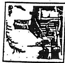
MARIPOSA COURTHOUSE BUILT 1854

EASTBOUND LANE ONLY, HIGHWAY 140 FROM 49S TO 8TH ST.