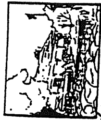
MARIPOSA HISTORICAL CENTER

Compliments of MARIPOSA COUNTY TITLE CO.