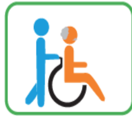
Walking or moving around